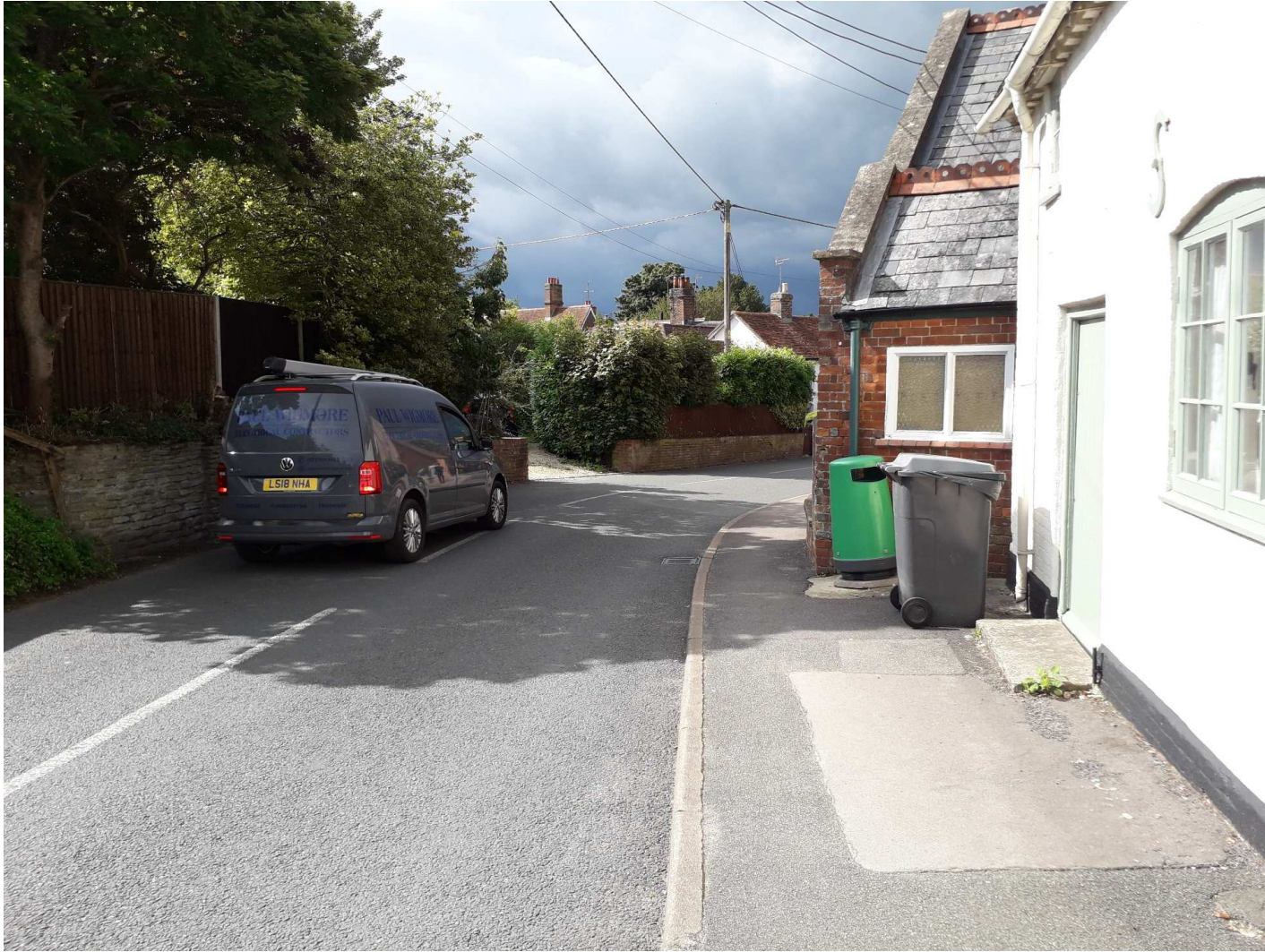
View of southern elevation of former Kintbury Methodist Church (Inkpen Road)