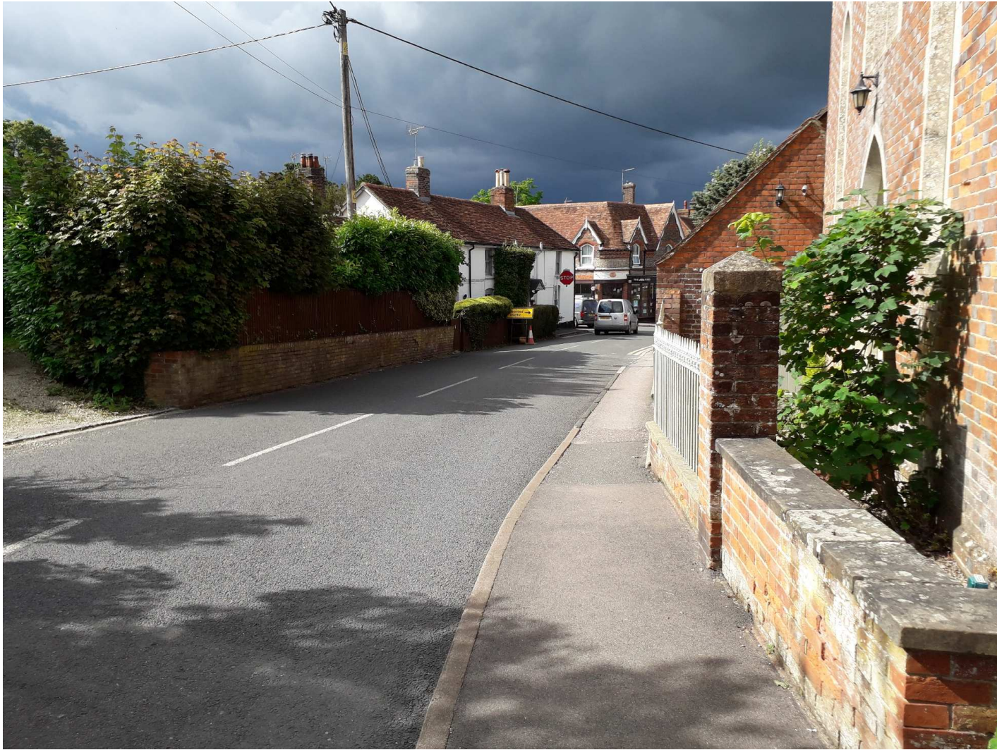
View from Inkpen Road (towards Station Road)