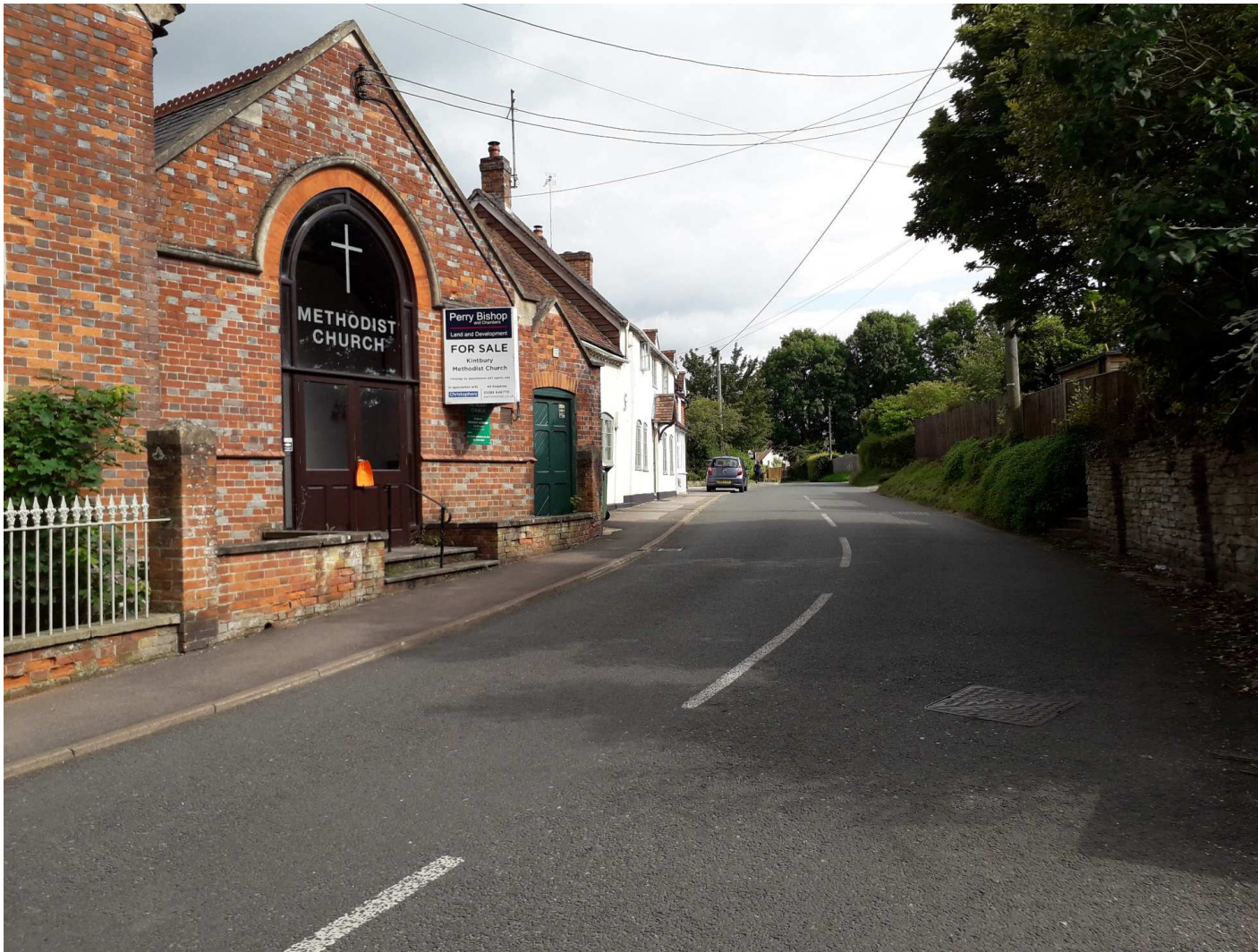
View of western elevation of former Kintbury Methodist Church (from the other side of Inkpen Road)