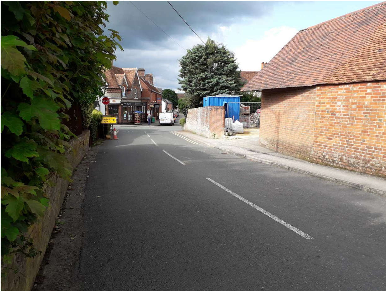
View from Inkpen Road (towards Station Road)