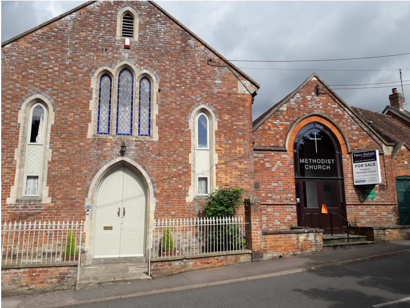
Front view of former Kintbury Methodist Church (Building on the right)