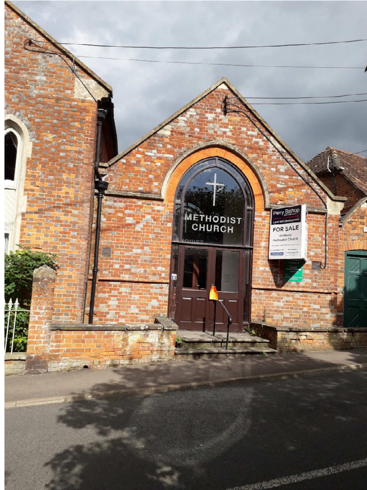
Front view of former Kintbury Methodist Church